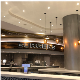
SOFI STADIUM & YOUTUBE THEATER