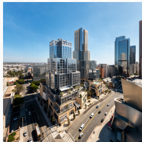
THE GRAND LA