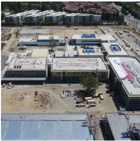
KATHLEEN MACDONALD HIGH SCHOOL AWCI Excellence in Construction Quality