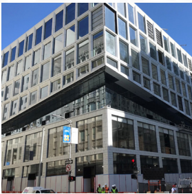
120 STOCKTON WACA Construction Excellence

THE RAYMOND GROUP IS ONE OF CALIFORNIA'S MOST EXPERIENCED FIREPROOFING CONTRACTORS. With over 50 years of fireproofing experience, we've successfully fireproofed hundreds of structures ranging from small office buildings to large commercial towers. Our total commitment to excellence and professionalism has made Raymond one of the most trusted names in construction contracting.