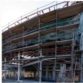
SOUTHWESTERN COLLEGE PERFORMING ARTS WWCCA Project of the Year