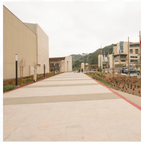
LEGACY INTERNATIONAL CENTER WWCCA Project of the Year